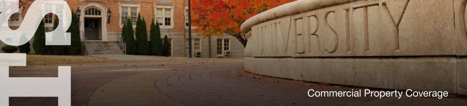
Commercial Property Coverage