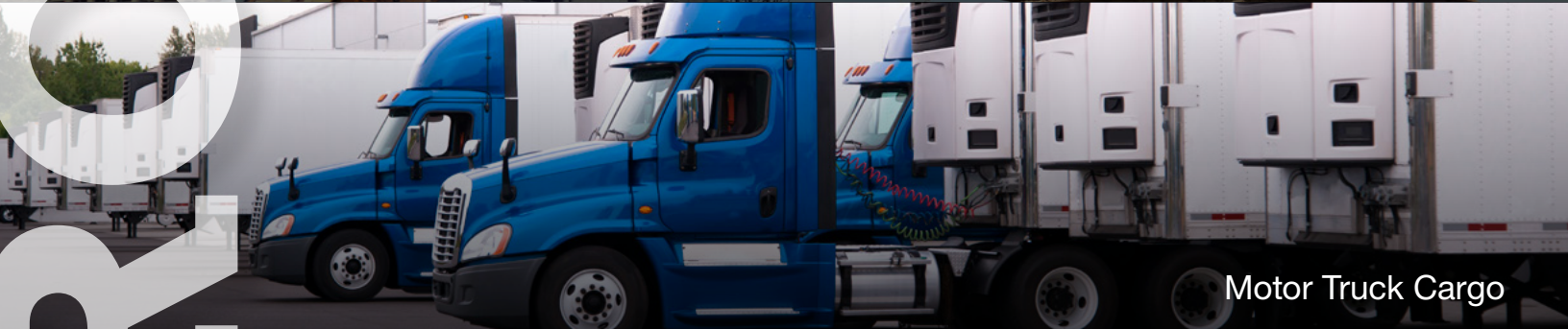
Motor Truck Cargo