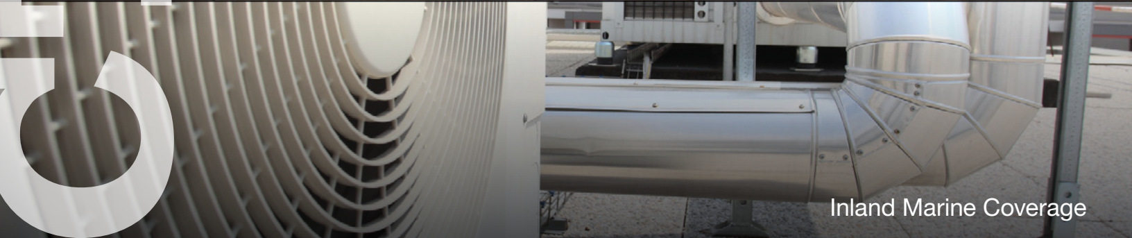
Inland Marine Coverage