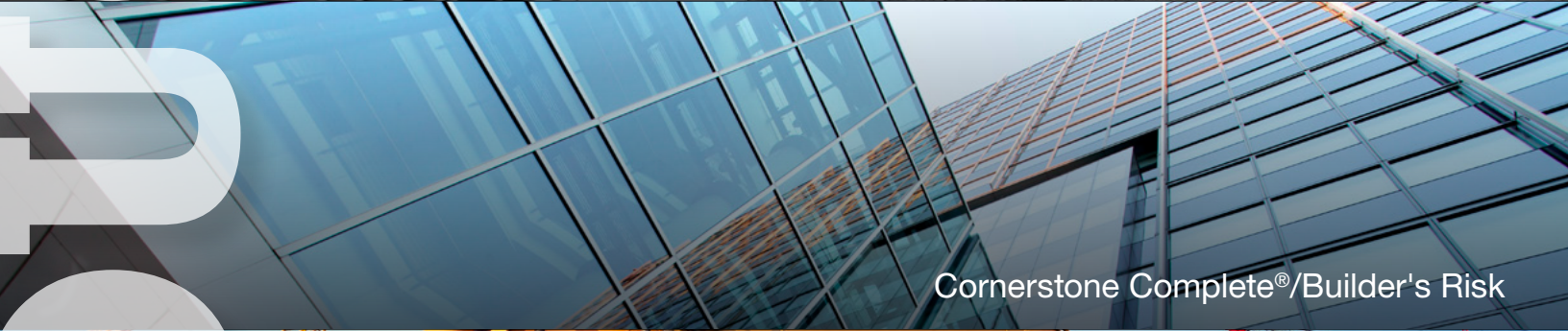
Cornerstone Complete®/Builder's Risk